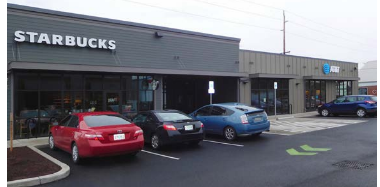
STARBUCKS DRIVE THRU SIGNAGE OPPORTUNITY