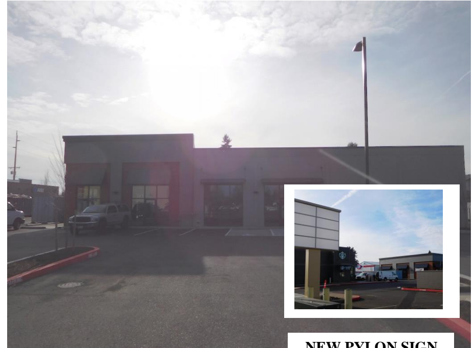
NEW PYLON SIGN