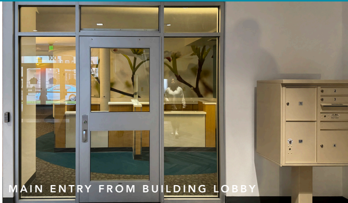
MAIN ENTRY FROM BUILDING LOBBY