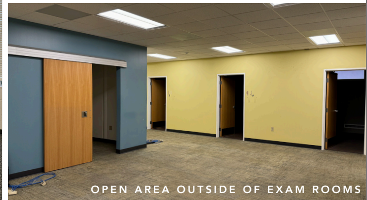
OPEN AREA OUTSIDE OF EXAM ROOMS

The information in this package was gathered from sources deemed reliable, however Evans Elder Brown & Seubert makes no representation or warranty of the accuracy of the information. Any buyer or tenant considering a purchase or lease of this property should confirm any and all information relied upon in making the decision to purchase or lease prior to finalizing the transaction and bears the risk of all inaccuracies.