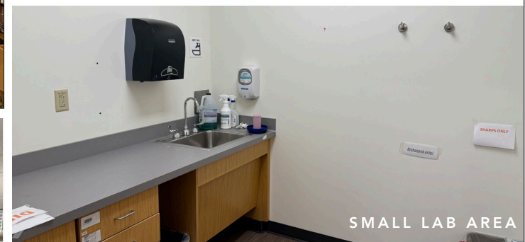
SMALL LAB AREA