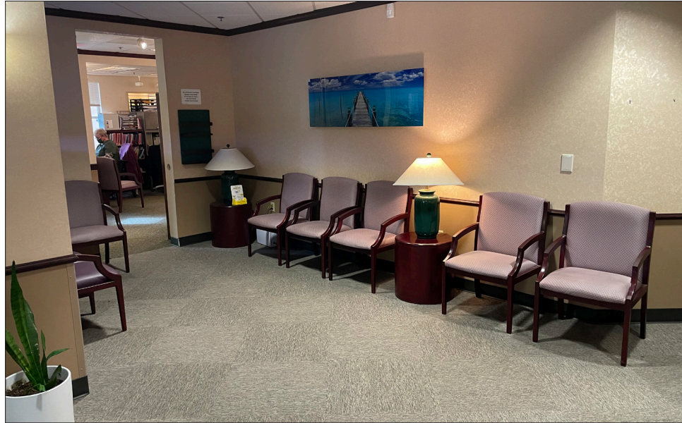
Surgery Center Access to adjacent surgery center by separate agreement.